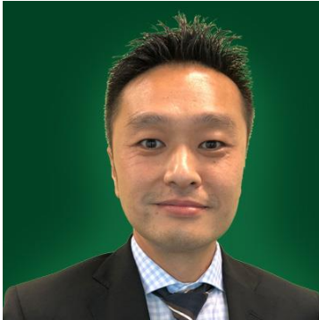
VICE PRESIDENT, RETAIL BANKING