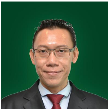
ASSISTANT VICE PRESIDENT, ACTING HEAD IT